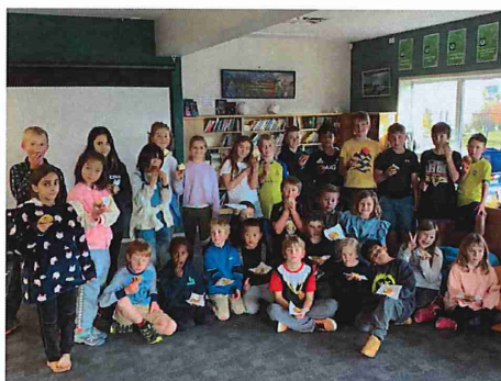
The Kids in fine form.