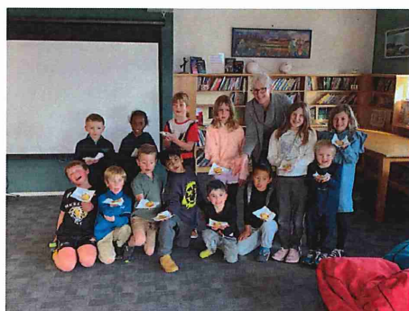
Our Apple Crumble Makers