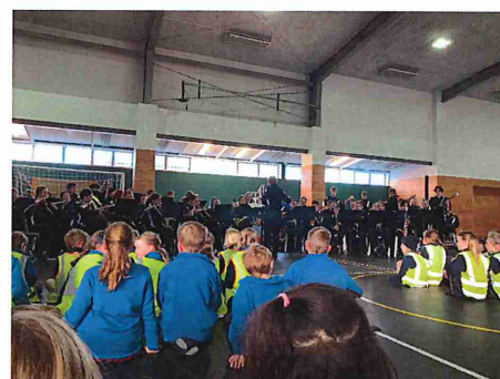
Our Choral Performance