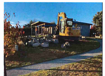
Kindergarten Rock Garden